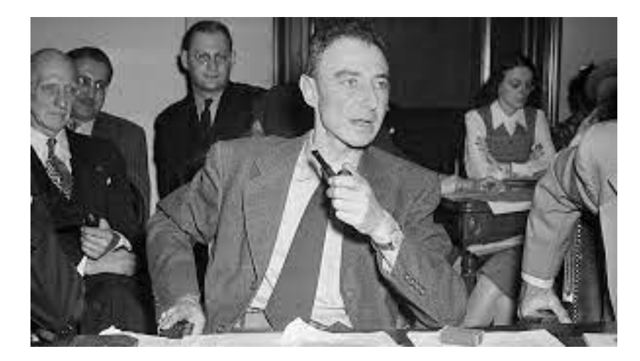
Robert Oppenheimer at the AEC hearing.

(As reprinted in The Oak Ridger's Historically Speaking column on July 14, 2023)